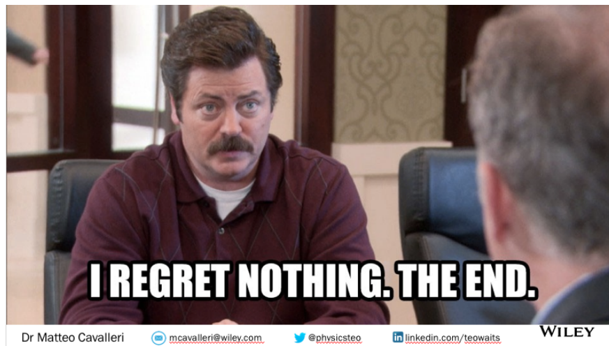
Figure 1: Take home message: NO REGRETS

Rich media available at https://speakerdeck.com/teowaits/my-escape-from-the-lab-scientific-publishing