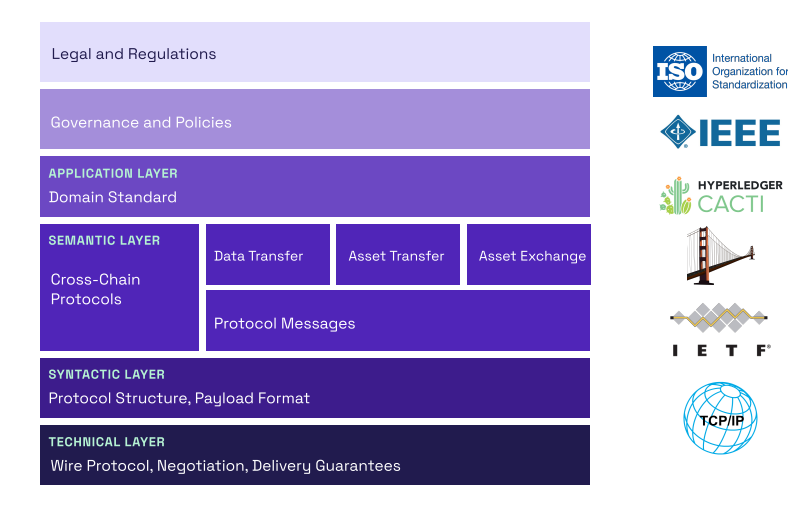
Fig. 2. Blockchain interoperability layers [9]

from a source chain to a third-party chain, and tokens to operate such a sidechain need to be bridged from the source chain [78]. Thus, we believe cross-chain interoperability is necessary, a fact supported by the extensive academic work done in the last decade [12], and the industry [25, 77], with several sources even referring interoperability as key to mass adoption [12, 26, 69].